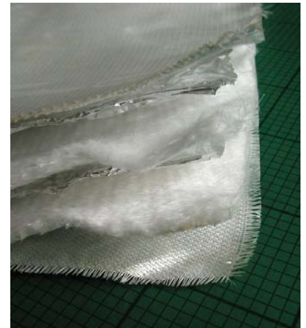
3 foil layers interleaved with high temperature glass fibre construction