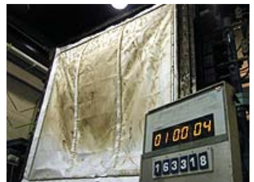
Flamestop FSI undergoing fire test at Bodycote Warrington Fire